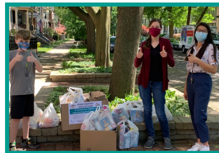
Supporting our neighbors facing food insecurity

Zoom or Phone Call & Mail Connection with members who prefer to participate in Ministry Forums remotely.