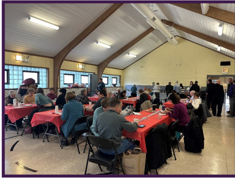
Gathering as one body in Christ

125 years ago, as new neighbors were settling in this growing community, they found themselves distanced and isolated from their home churches, apart from the places of worship and fellowship that sustains their life of faith. They gathered to start a new church here, a place where they can belong, and where they would pool their resources to build a new church home we call Concordia. This is our church home and we give thanks for their ministry now entrusted to us. As they were called to engage in ministry and answered that call by their commitments to live as the body of Christ in this place, so today we are also called.