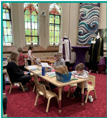
Children in our Family Space area on Sunday mornings

125 years ago, as new neighbors were settling in this growing community, they found themselves distanced and isolated from their home churches, apart from the places of worship and fellowship that sustains their life of faith. They gathered to start a new church here, a place where they can belong, and where they would pool their resources to build a new church home we call Concordia. This is our church home and we give thanks for their ministry now entrusted to us. As they were called to engage in ministry and answered that call by their commitments to live as the body of Christ in this place, so today we are also called.