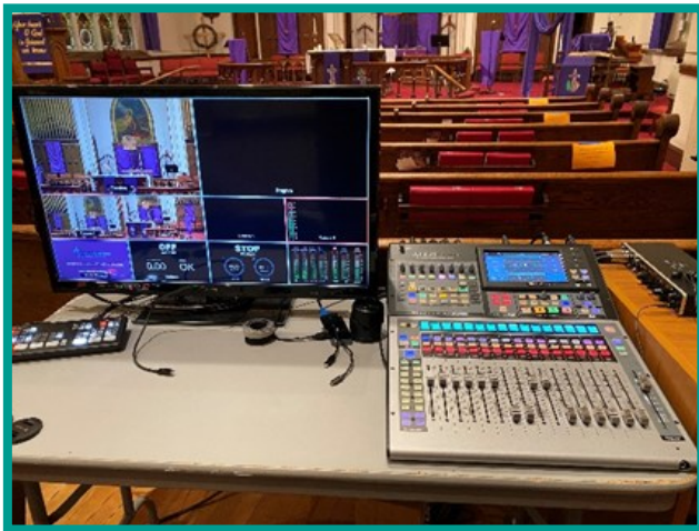
Technology expands our ability to worship beyond our walls

Two and a half years struggling with the COVID pandemic inspired creative ways to respond to the health, safety, and isolation of the members of our church community: recorded and virtual worship, music ministry offerings, zoom meetings and virtual events. These solutions, as valuable as they proved to be, still left us missing important ways of belonging: connecting with each other before or after worship, shared fellowship over a meal, gatherings for ministry and celebration and the joy of our life together in the body of Christ.