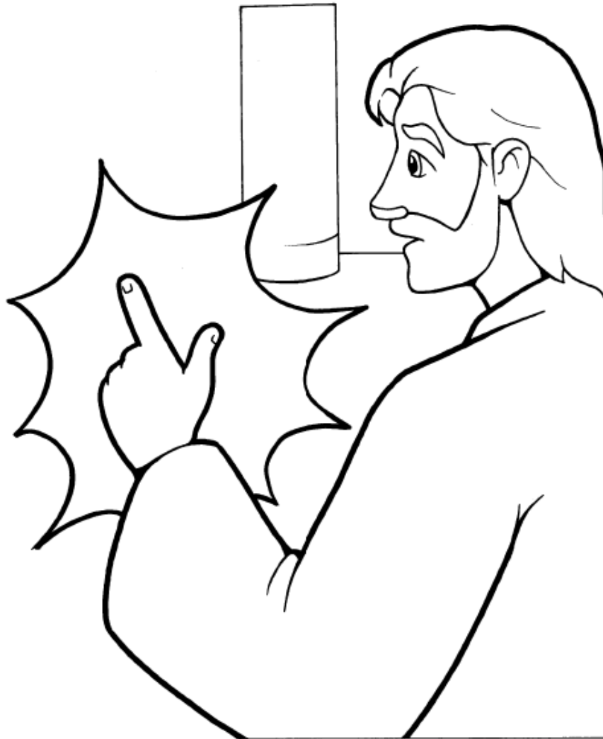
Jesus Appears to the Disciples